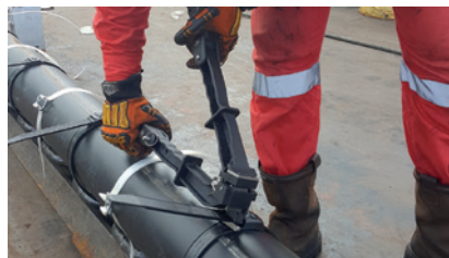
Smart® Tie and SM-FT-2000-19 Hand Tool

Demonstration videos are available to view on our website.