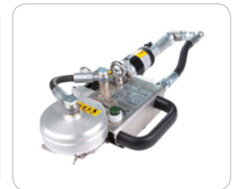
SM-FT-3000-19 or SM-FT-3000-32