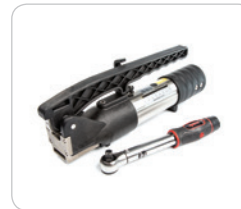
SM-FT-1000-20ST or SM-FT-1000-32ST